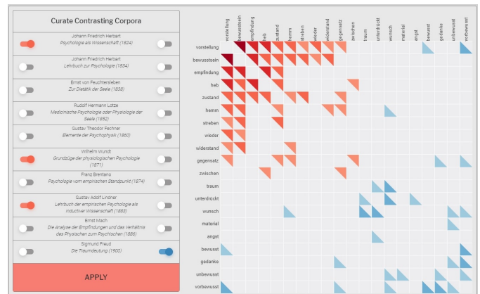
Fig. 3. Comparative Word-Matrix view, displaying the co-occurrences of selected words in two different corpora, enabling scholars to detect trends in discourse through time.